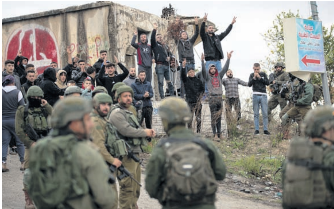
Israeli soldiers stand between Palestinians and a Jewish settler following a settler attack on the West Bank village of Burqa, Friday, Dec. 17, 2021.